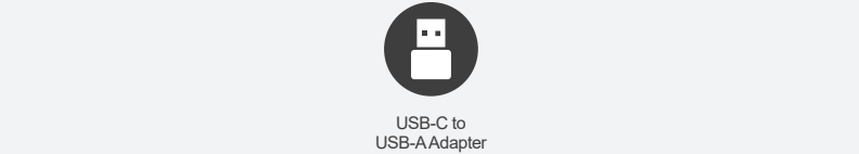
USB-C to USB-A Adapter

Your order has been carefully packaged and inspected. The following accessories should be included in your package. Please inspect the contents of the package to ensure that you have received all items and that nothing has been damaged. If you discover a problem, please contact us immediately for assistance.