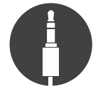
3.5 mm Cable